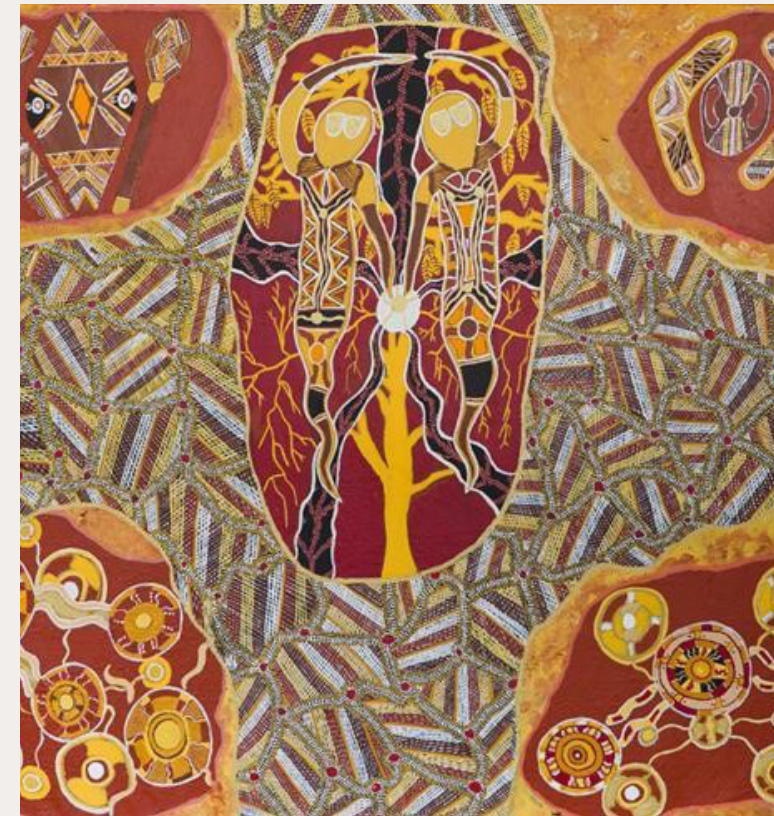
Artist: Wally Edwards Compliments by The Torch